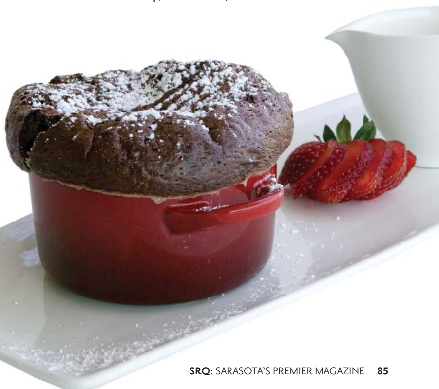
Opposite page: Sur la Table yellow dinner plate, $11 and yellow dipping bowl, $4. Waechersbach red square plate, $23. This page: Emile Henry yellow serving plate, $19. Schott Zwiesel glass, $9. Le Creuset Stoneware mini round soufflé dish, $18. All dishware available at Sur La Table, 22 N. Lemon Ave., Sarasota, 941-365-0380